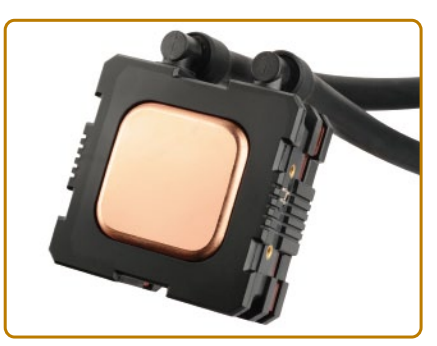
Protrusive Copper Base